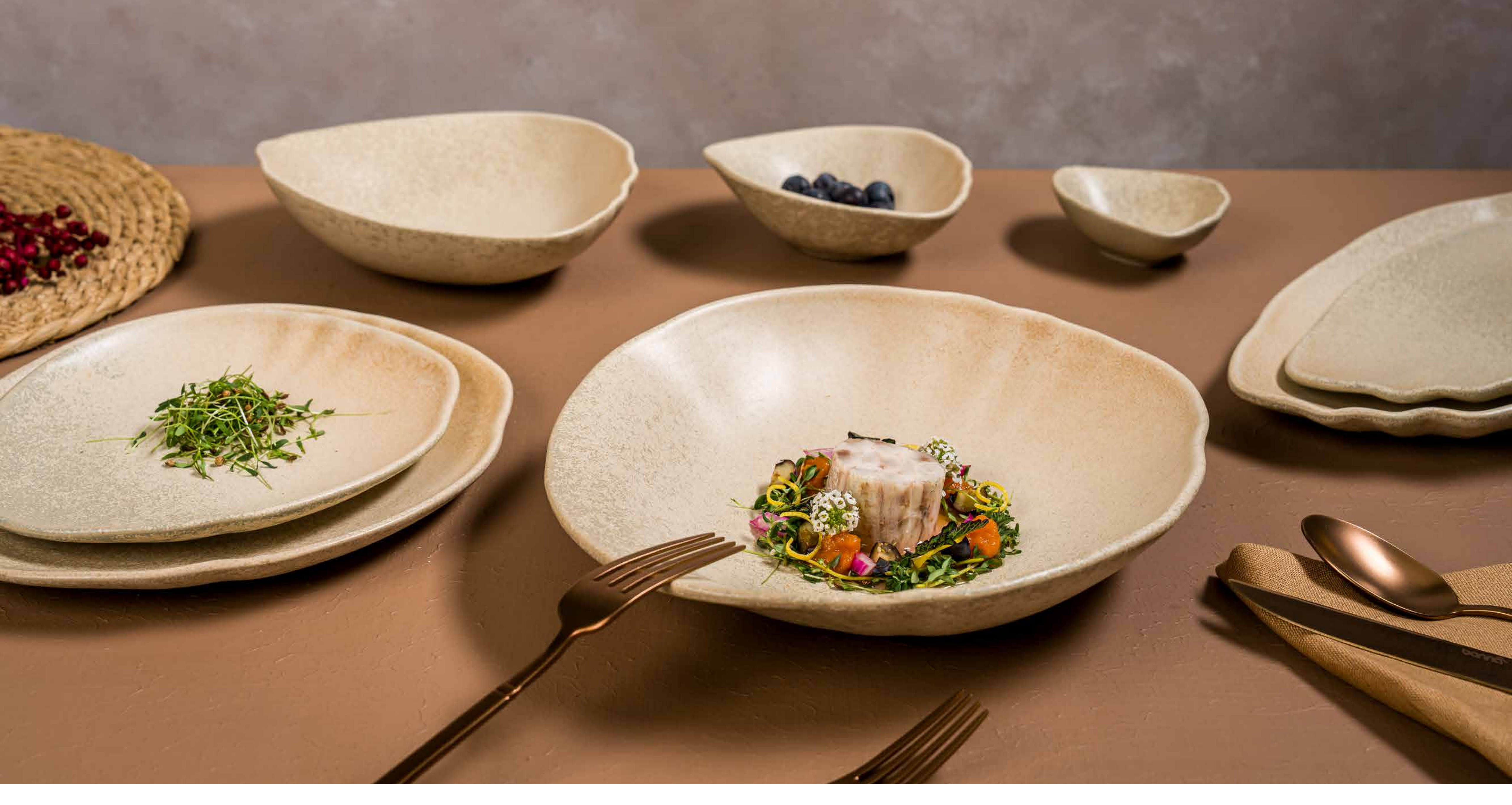
www. bonna .com.tr